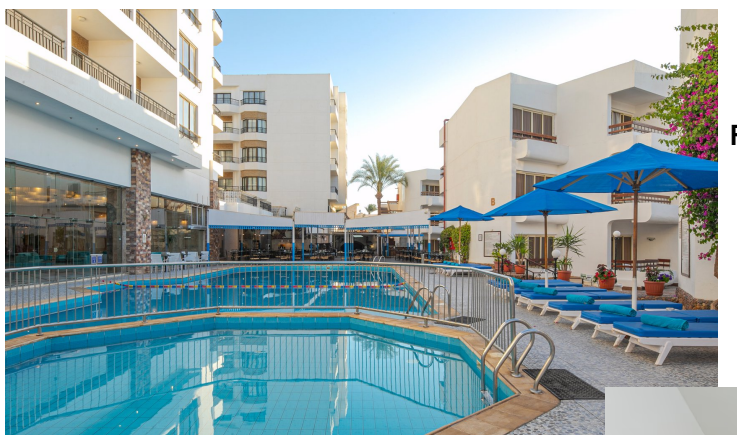
From 100 USD per night

The resort features 434 elegantly designed rooms to cater to all needs and preferences. Each room is perfectly suited for couples and families, offering modern amenities amid views of the pool, gardens or ocean. As you relax in your room, take in the serene sights of lush gardens and shimmering waters.